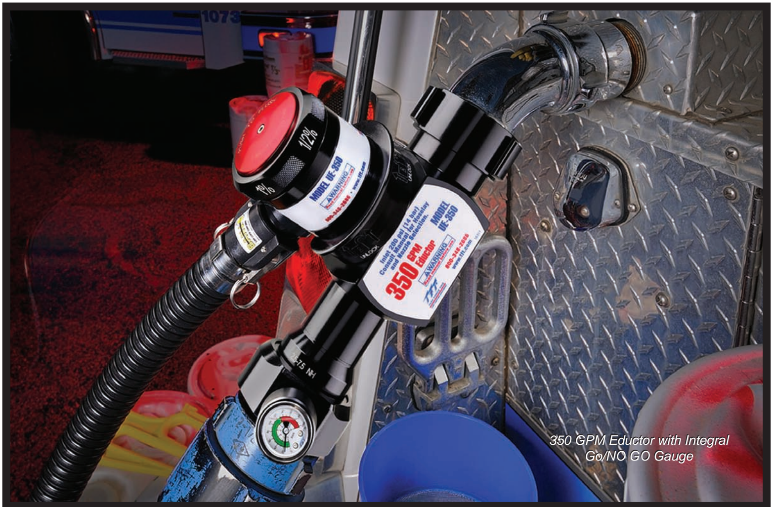
350 GPM Eductor with Integral Go/NO GO Gauge